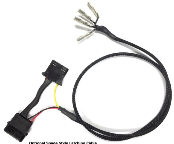
Optional Spade Style Latching Cable