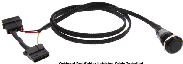
Optional Pro-Solder Latching Cable Installed