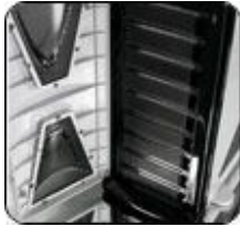
Metal grilled front bezel for maximum air intake