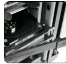
Removable HDD cage