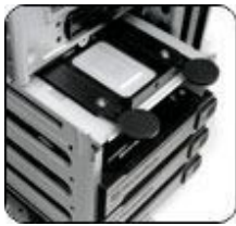
Removable HDD cage