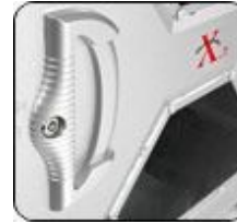
Security for lockable safety side-panel