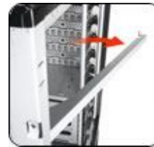
Removable PSU support bar