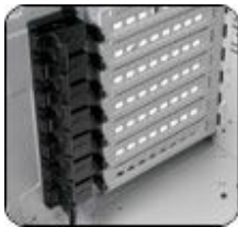
7 screwless PCI slots