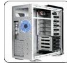
5 5.25" and 4 3.5" device