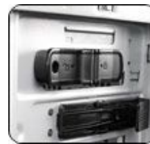
3.5" slot-in to lock device