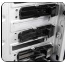
5.25" slot-in to lock device