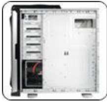
Organized HDD cable management