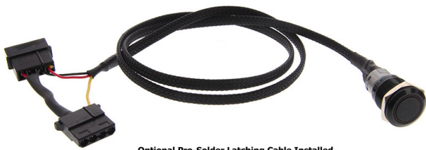
Optional Pro-Solder Latching Cable Installed