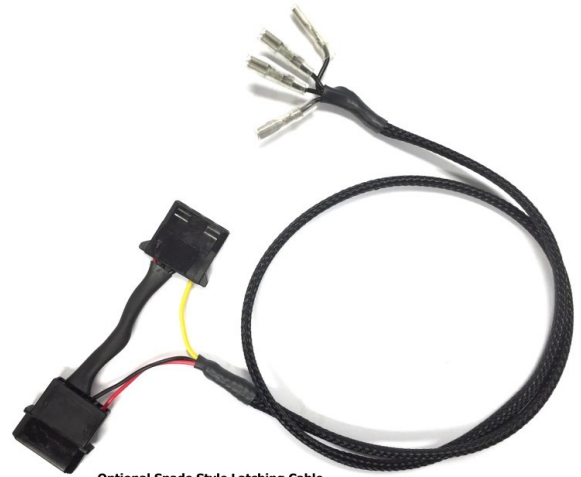
Optional Spade Style Latching Cable