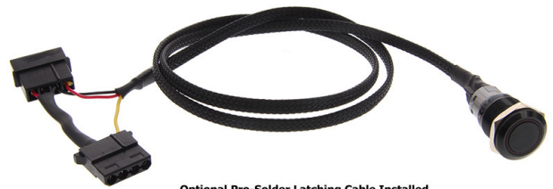
Optional Pro-Solder Latching Cable Installed