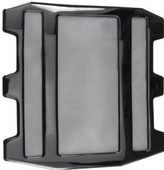
New Optional Front Filter!