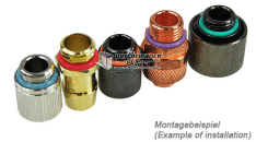
Montagebeispiel (Example of installation)