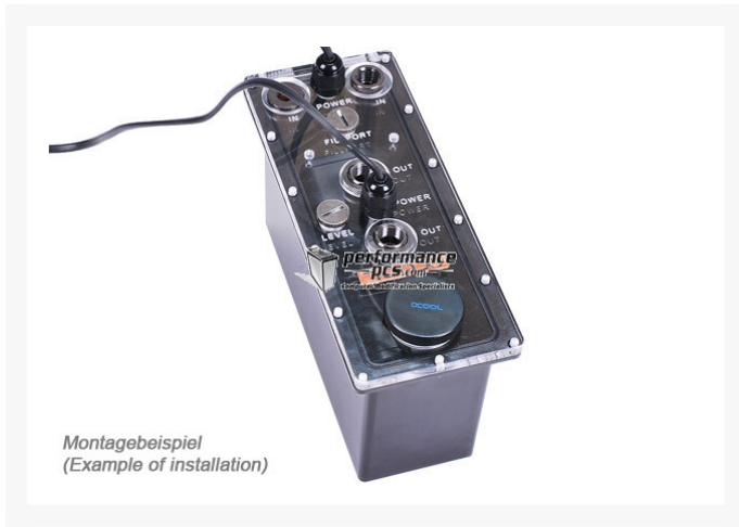
Montagebeispiel (Example of installation)